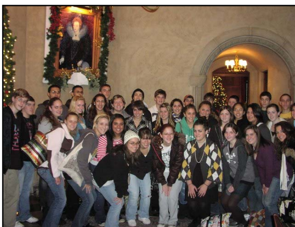
21st Century Scholars Visit Coe Hall and discuss The Great Gatsby.

B ethpage High School is a leading voice in the promotion of 21st century skills. Our 21st Century Scholars program has been featured in national magazines, including Educational Leadership (September 2009). This unique program is based on the Framework of the Partnership for 21st Century Skills. Students maintain an online portfolio of activities in the areas of Communication, Information Technology, Global Awareness, Financial Literacy, Health Literacy, Career Awareness and Community Service.