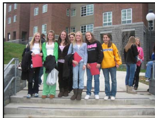
21st Century Students Visit Marist College.

All activities are after school, on weekends or vacations and have included museum visitations, guest speakers, simulations, literature circles, producing documentaries, original poetry readings,