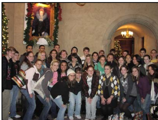
21st Century Scholars Visit Coe Hall and discuss The Great Gatsby.

foreign films, dance classes, foreign language exploration, fitness events and health awareness. Students maintain the portfolio and produce artifacts for a portfolio— films, music, poetry, essays, and reaction papers.